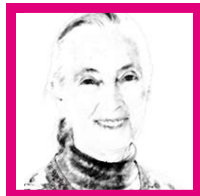
I am Jane Goodall . My challenge for 2030 is...