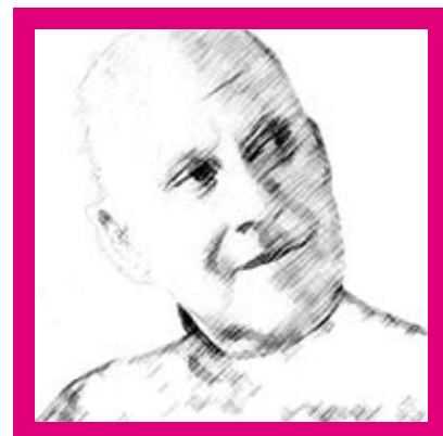
I am Norman Foster and my challenge is...

NOW YOU CAN CREATE AN AGENDA FULL OF VALUES