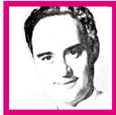
I am Ferran Adrià and I propose for 2030...